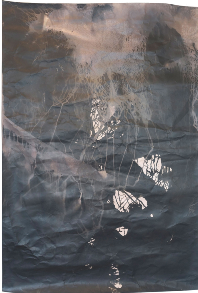
Joy Episalla, foldtogram (pink blk August 2)iteration 2, 2018 / 2022

Episalla is showing nine pieces, seven on the walls and two that mostly sit on the floor. The floor pieces read as sculpture, but all the works use photo paper that has been subjected to various processes: the chemical one that normally produces photographs (develop, stop, fix, and wash – for Episalla , not necessarily in that order); exposure to light; the physical manipulation of the paper; and, in at least one instance, burning. The palette is muted, limited to black and white, grey and brown, imparting an urban elegance at odds with imagery that evokes geology – deterioration as well as slow accretion, gradual organic processes that transform matter over long periods. I felt I was experiencing the kind of rough beauty that one comes across out in the world, unexpectedly, as when noticing the way water or light can alter the most obdurate substances.