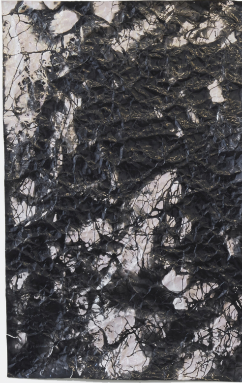
Joy Episalla, foldtoqram (pink blk August 1) iteration 2, 2018 / 2022