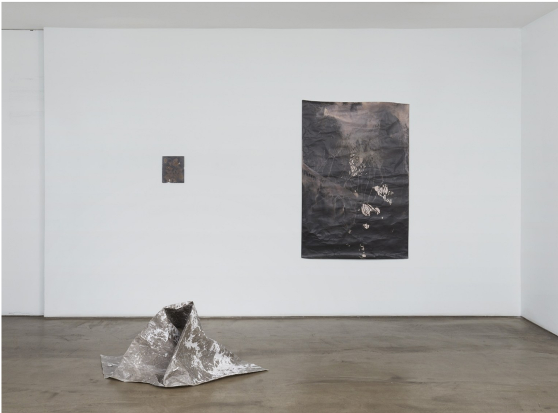
Joy Episalla, installation view