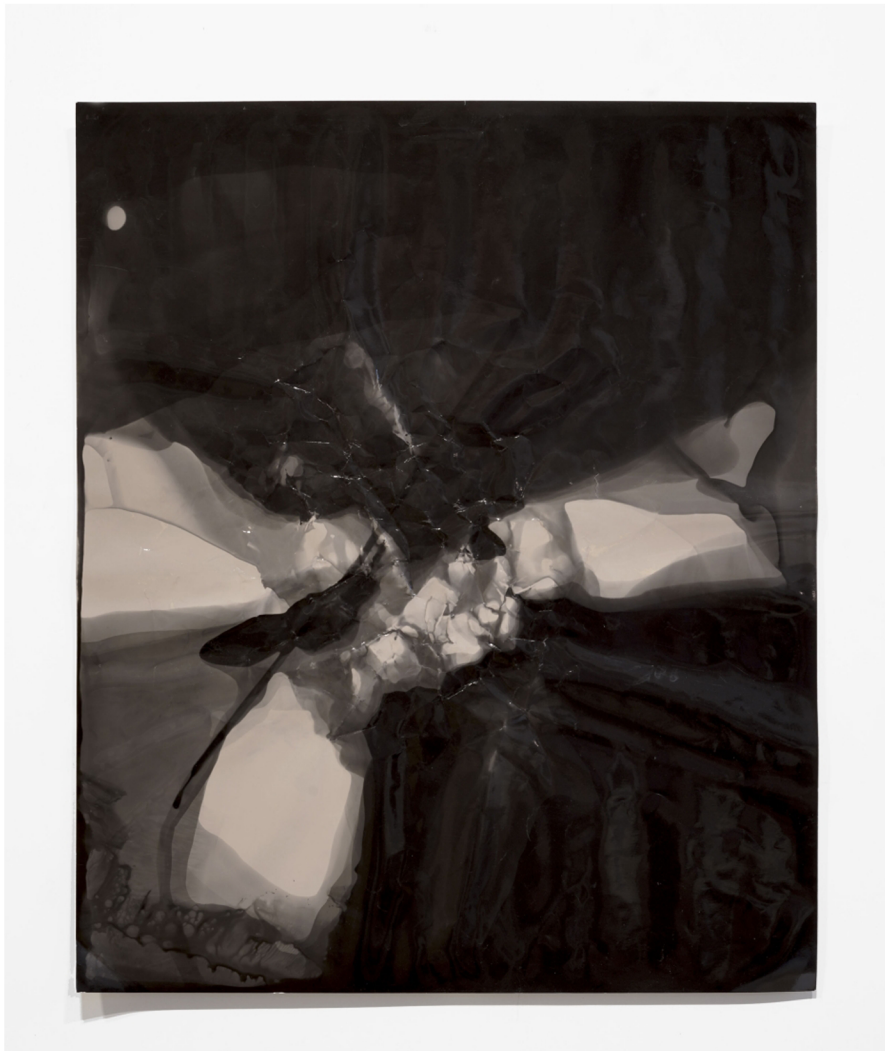
Joy Episalla, foldtogram (daylight 2) , 2018